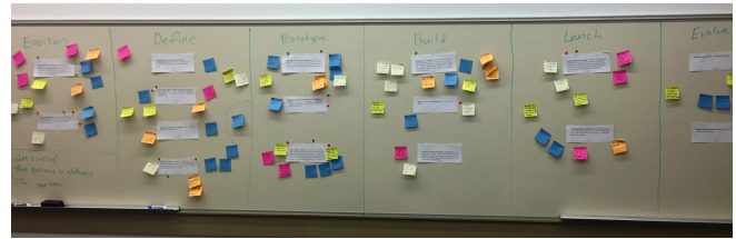
Figure 1. Item-level checklist feedback activity.

We then conducted two rounds of co-design workshops with 38 unique participants: 8 workshops, with a total of 19 participants, during the first round; and 19 workshops, with a total of 21 participants, during the second round. Each workshop was