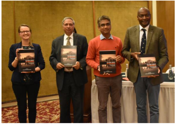
Picture 1: Launch of the volume 'The Global Compact of Refugees: Indian perspectives and experiences'

Book can be accessed here: https://www.unhcr.org/enin/publications/books/5e3174c54/global-compact-onrefugees-indian-perspectives-andexperiences.html?query=global%20compact%20on%20refu