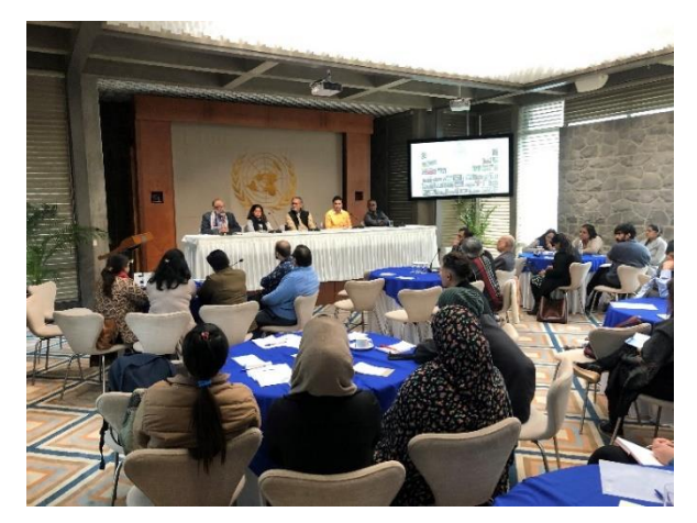
Picture 5 A civil society led consultation on the SDG principle 'leave no one behind' focusing on refugees was organised in Delhi

The Academicians' Working Group in partnership with UNHCR India launched a publication titled "Global Compact on Refugees: Indian Perspectives and Experiences". The publication is a compilation of 15 essays drafted by academicians, civil society representatives, journalists and law practitioners and draws on the Indian experience on refugee protection and solutions.