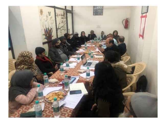
Picture 6 Consultation with communities on the SDG principle 'leave no one behind' in the context of the CSOled consultation